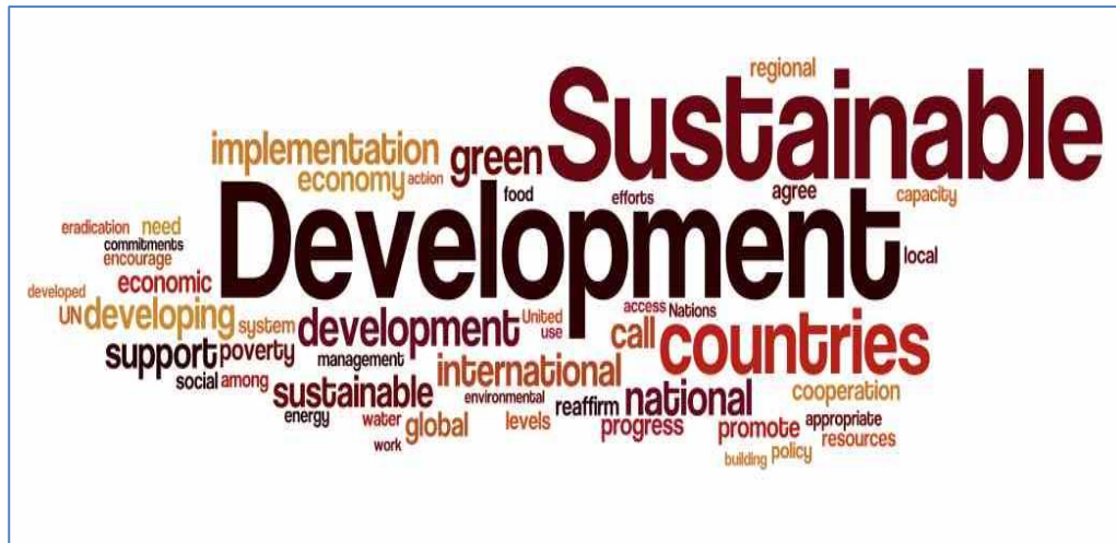
Figure 4: Zero Draft word cloud

'Implementation' is again very prominent. 'Economy' and 'economic', which are repeated 50 times altogether, appear then to be very important, showing how the economic pillar receives increasingly more attention than the social and the environmental pillars. The latter two words appear 20 and 17 times, respectively. Then, the word 'green' is expressed many times (39 repetitions) like the word 'sustainable', that is present 32 times. Very prominent are also 'support', 'poverty', 'progress', and 'cooperation'.