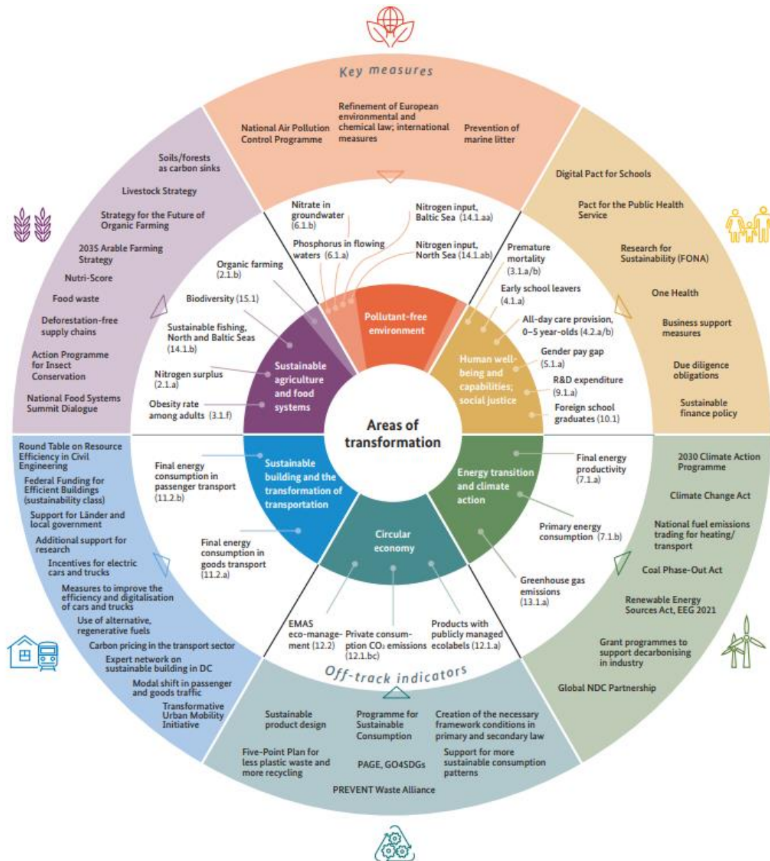
Figure 2 (German framework)

heavily based on the first GSDR (2019), only adding the lever of capacity building. 9 The second is a similar variant that is being used by the German Government since 2021. 10