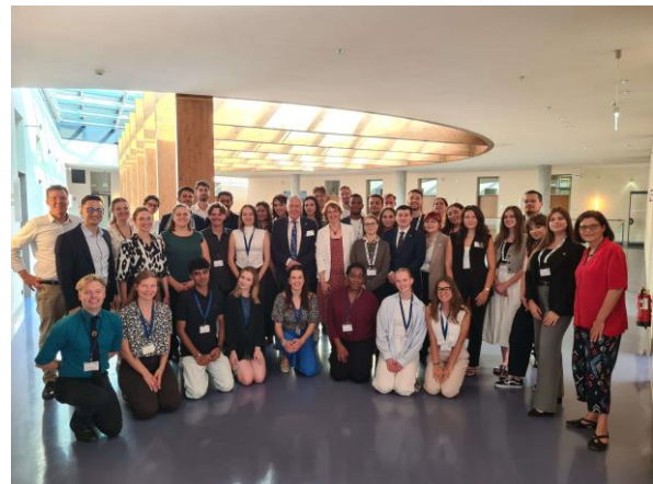
Photo challenge & Dinner

After presenting their visions of future well-being for their generation under four different scenarios, participants were asked to work in their groups to create an ideal scenario that combined elements from each of the previously discussed scenarios. Next, the four ideal visions were “reconciled” in a plenary session, where participants from all groups worked together to agree on the elements of a single, unified scenario for the future. The official part of Day 1 concluded with a short debriefing session.